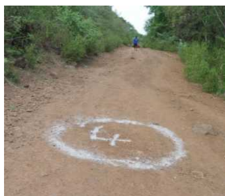
The cross is carried towards Kuron Bridge. The marking of station 4