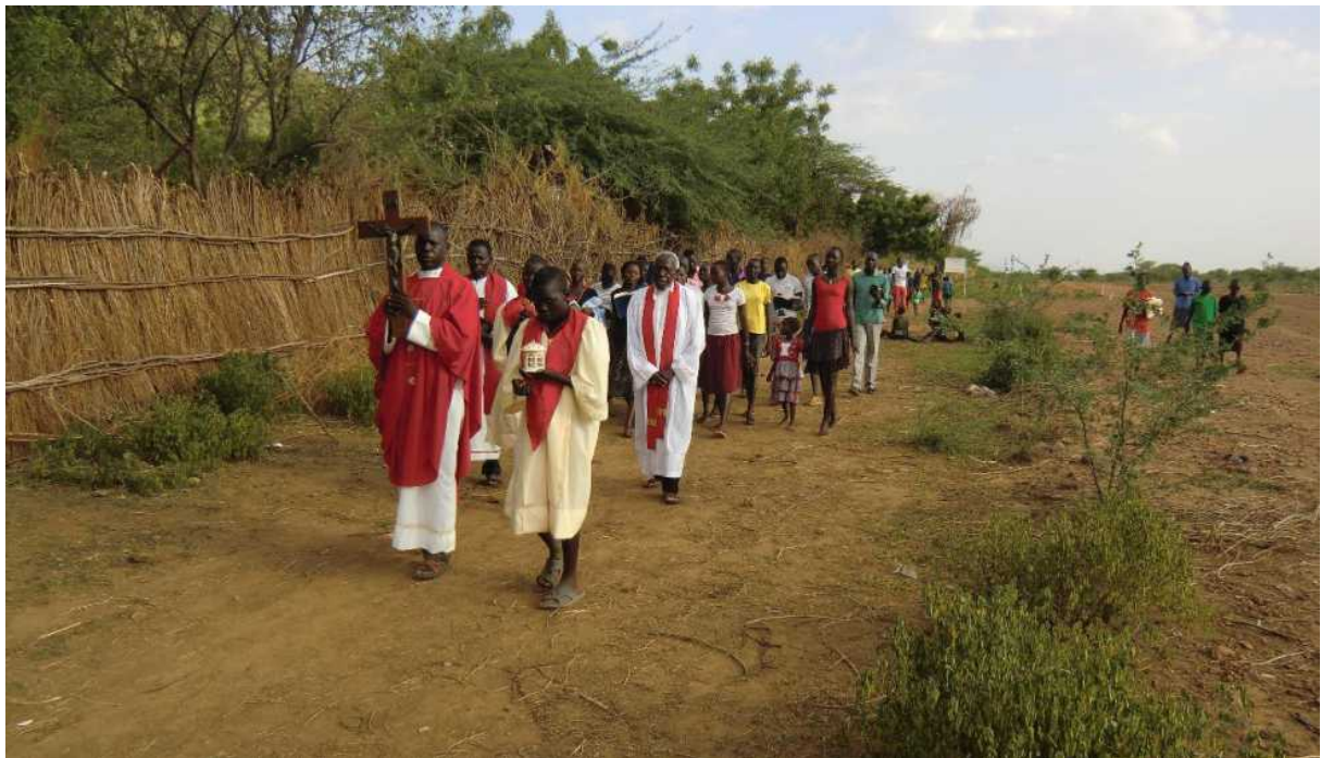
As this service ended, a procession brought the cross back from the school to Kuron chapel

The celebration also included the Holy Communion.