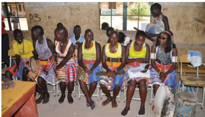
The choir had practiced ahead of Easter, and made an added value to the mass.