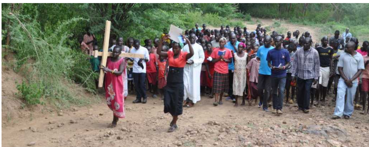
At each station a prayer was said and everyone kneeled. When walking; psalms were sung.