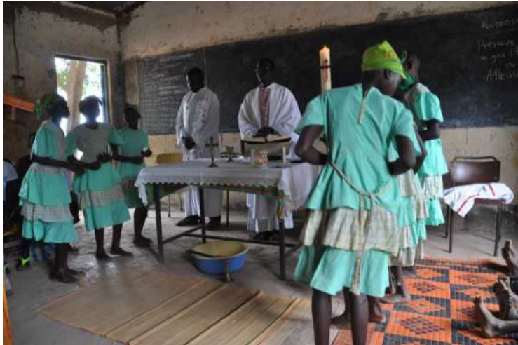
The girls are performing liturgical dance as the choir and the congregation are singing